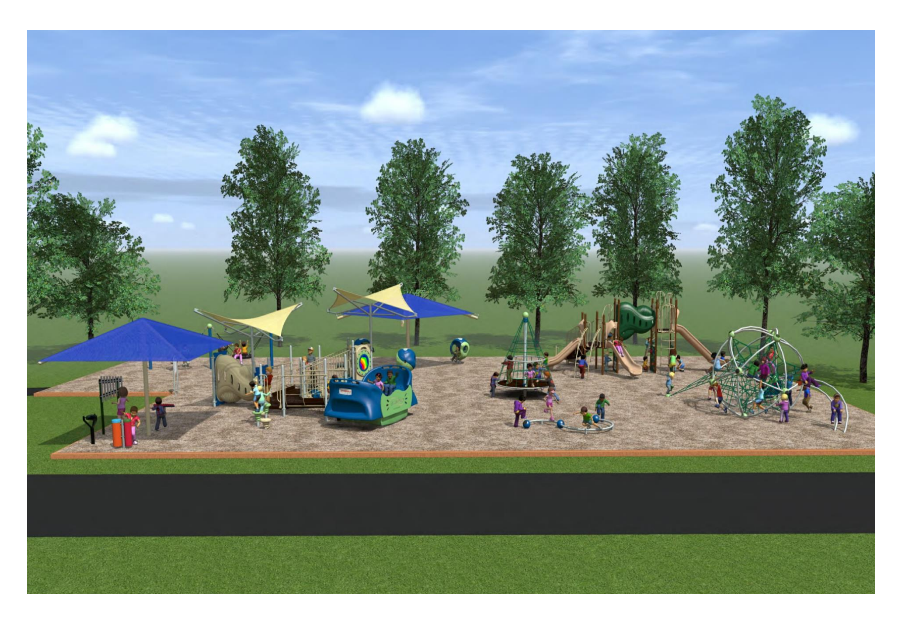
For more information, go to www.emmitsburgmd.gov